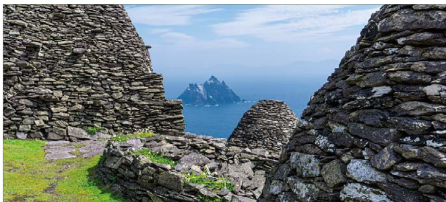
Skellig Michael

Ireland offers a rare blend of history and living tradition. Dublin's Book of Kells and the Valley of Glendalough root the contemplative spirit in beauty and silence. Across the country, stone circles, high crosses and Newgrange testify to a cosmic imagination. Holy wells still honour