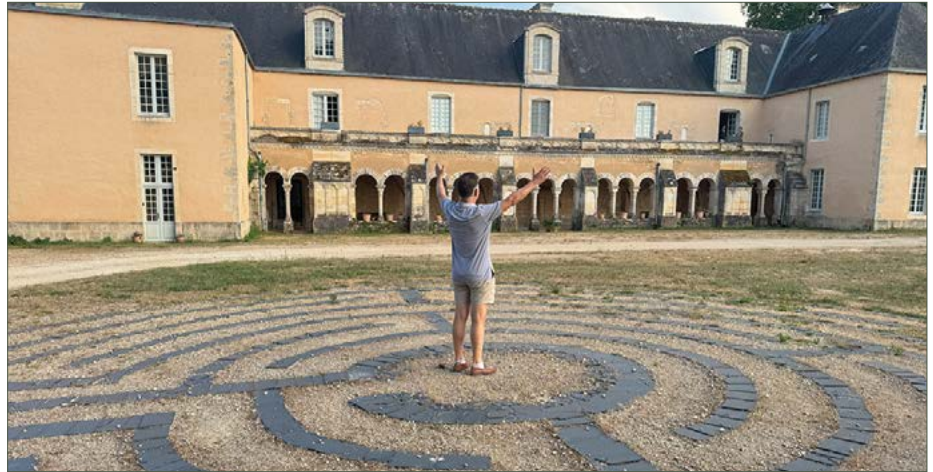
Bonnevaux Labyrinth

The loss of meaning or sense of purpose in a whole culture may happen when, for example, God and transcendence have disappeared. The social pointlessness soon seeps into the despair people feel about their personal life. Never before our time, perhaps, has the general population – we are talking