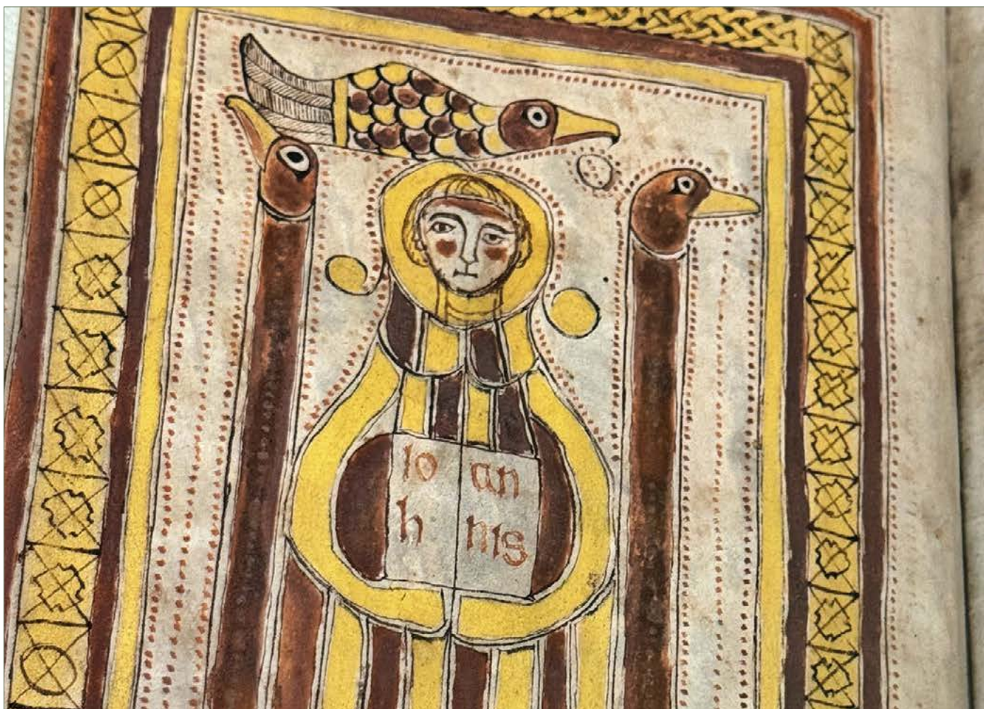
Facing page from the Gospel of St John, early 9th century