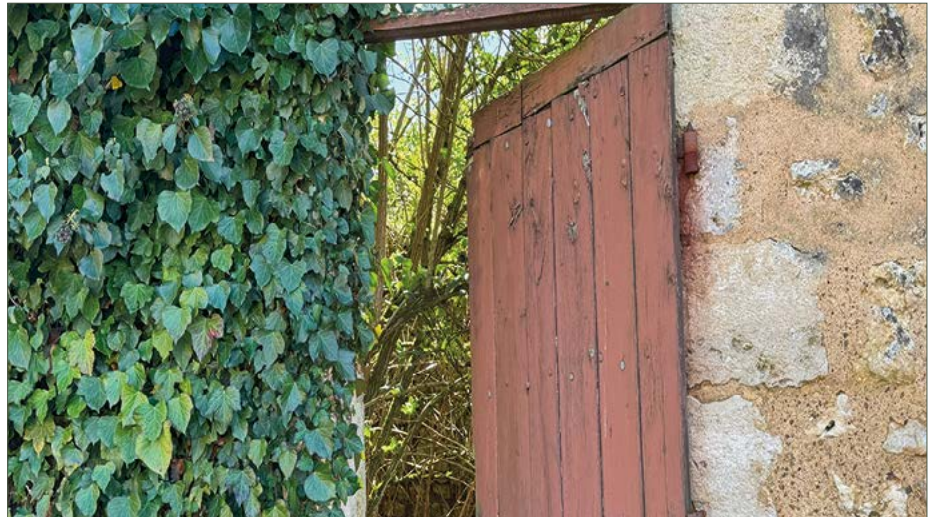
Bonnevaux

It might amaze us today in our secularised world to read such unashamedly passionate declarations of love for God. We should more likely expect a God who is absent or has died or a believer enduring a Dark Night of the soul. I thought of this great shift recently while talking to a young person who was going through a painful breakdown of trust and faith in life. When, after a long silence, I heard the quiet question, 'what's the point?', I felt the depth of disillusionment and disappointment it revealed. Whatever I or anyone might reply to this – one could say that breakdown leads to breakthrough, that everything is passing – would sound like a hollow platitude, false encouragement. But whatever might be said, we don't learn the meaning of things through words. It is only in the heart's conversion,