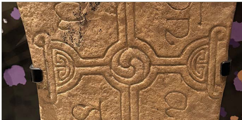
Celtic Cross

the monastery to be educated and raised in community until they make their own decision about staying or leaving. Later in monastic history, oblates became individuals normally living outside the cloister but 'associated' – at a safe distance – from the monks and their life. Many kinds of oblates developed over the centuries because the Benedictine spirit is instinctively inclusive and prefers to find ways of belonging rather than excluding. With the decline of the institutional monasticism, which evolved long after Benedict and throughout the medieval period, a sense of crisis has arrived. It is called a crisis of vocations, but if what I have been saying has any point to it, there is no crisis in the numbers feeling called to serious contemplative life or expressing their own 'monk within' by living the essentials of monasticism.